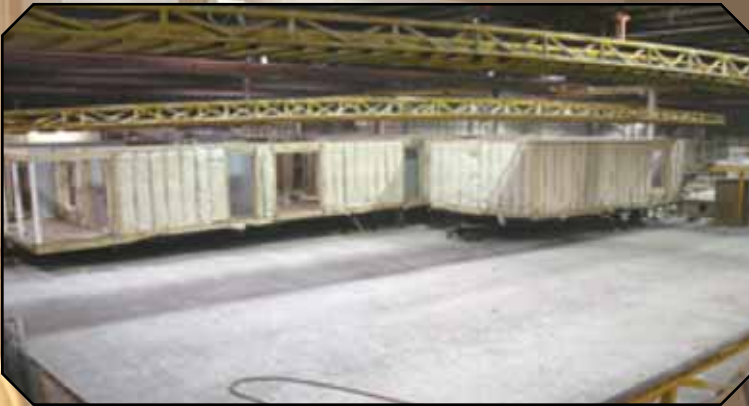
Modular Building Weather