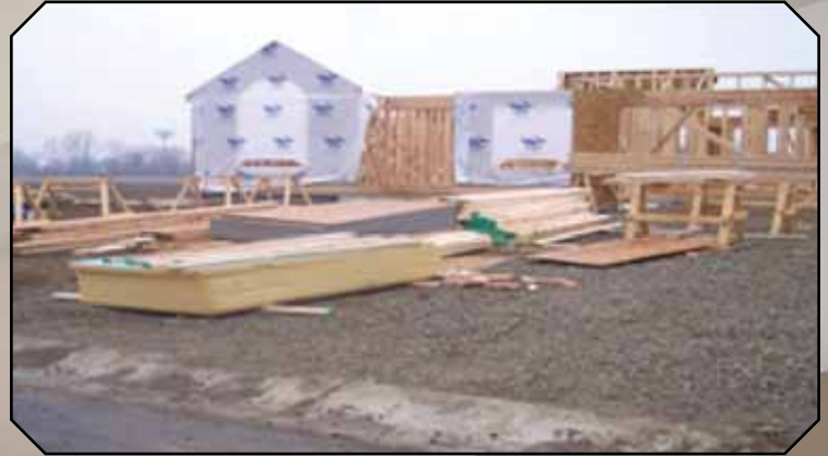
On-Site Built Lumber - Outdoor Storage