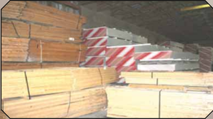
Modular Lumber - Neatly Stored Indoors